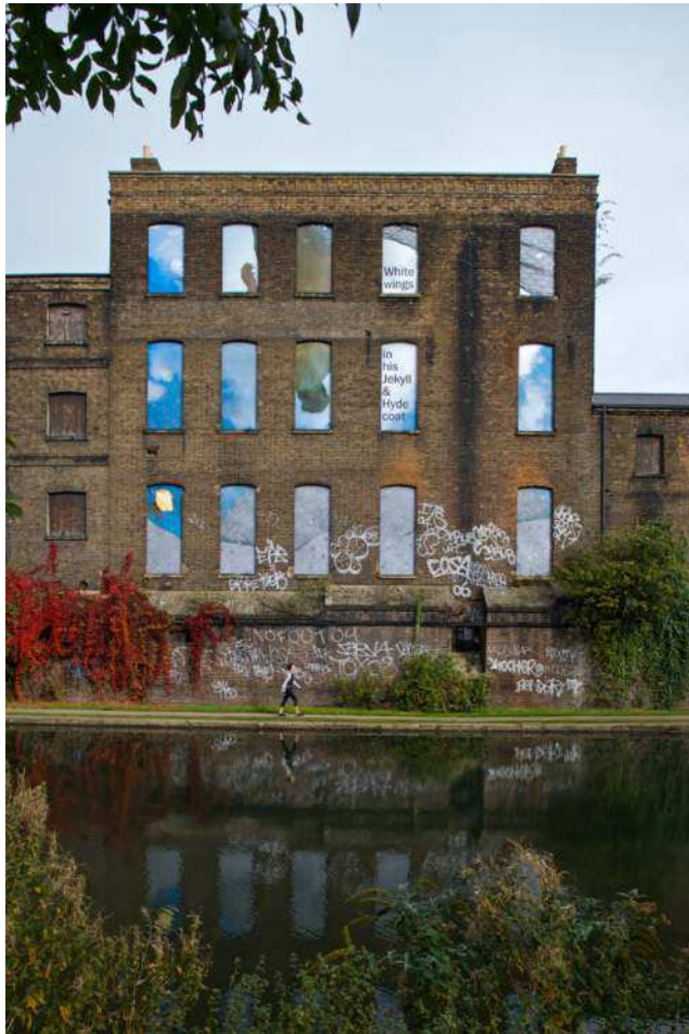
Fish and Coal Building