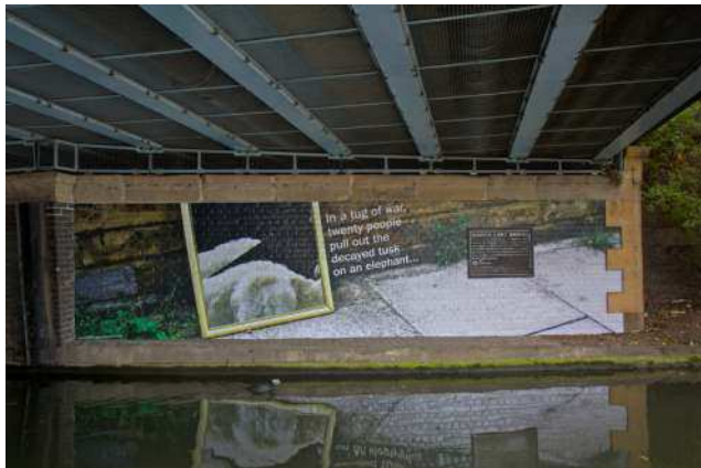
York Way Canal Bridge