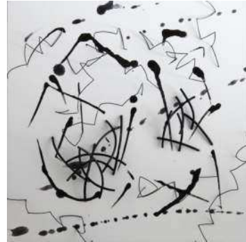
Ways 3 , Acrylic paint and plastic monofilament, 31 x 31 x 9 cm, 2013 Stop go , Acrylic paint and plastic monofilament, 15.5 x 15.5 x 9 cm, 2013 Mingle 2 , Acrylic paint, plastic monofilament and plastic tube, 31 x 31 x 9 cm, 2014

Patrick Heide Contemporary Art is delighted to announce “Counterpoint”, the first solo exhibition of Ann Sutton’s canvases and drawings, curated by Gill Hedley.