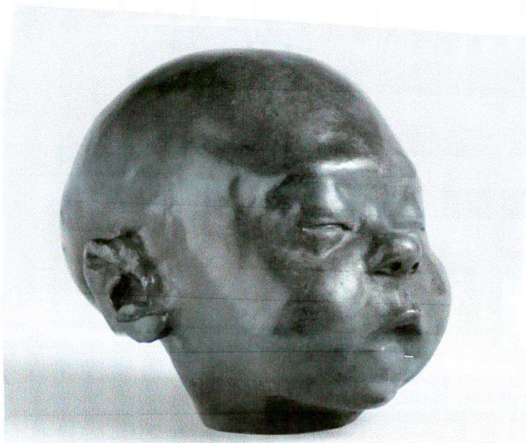
Baby Asleep (1904), Jacob Epstein