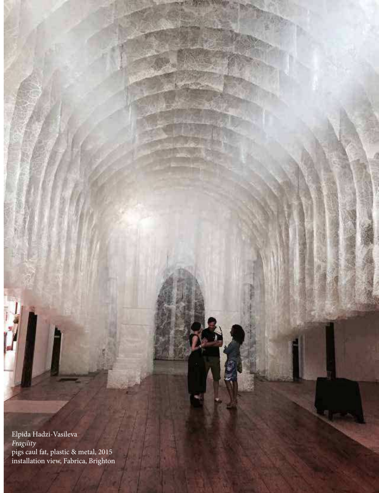
Elpida Hadzi-Vasileva Fragility pigs caul fat, plastic & metal, 2015 installation view, Fabrica, Brighton