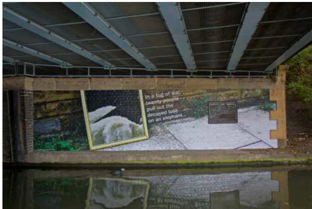
York Way Canal Bridge