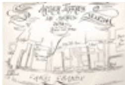
The map provided for guests in Venice