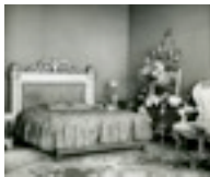
Arthur's bed with damask bedhead and cover